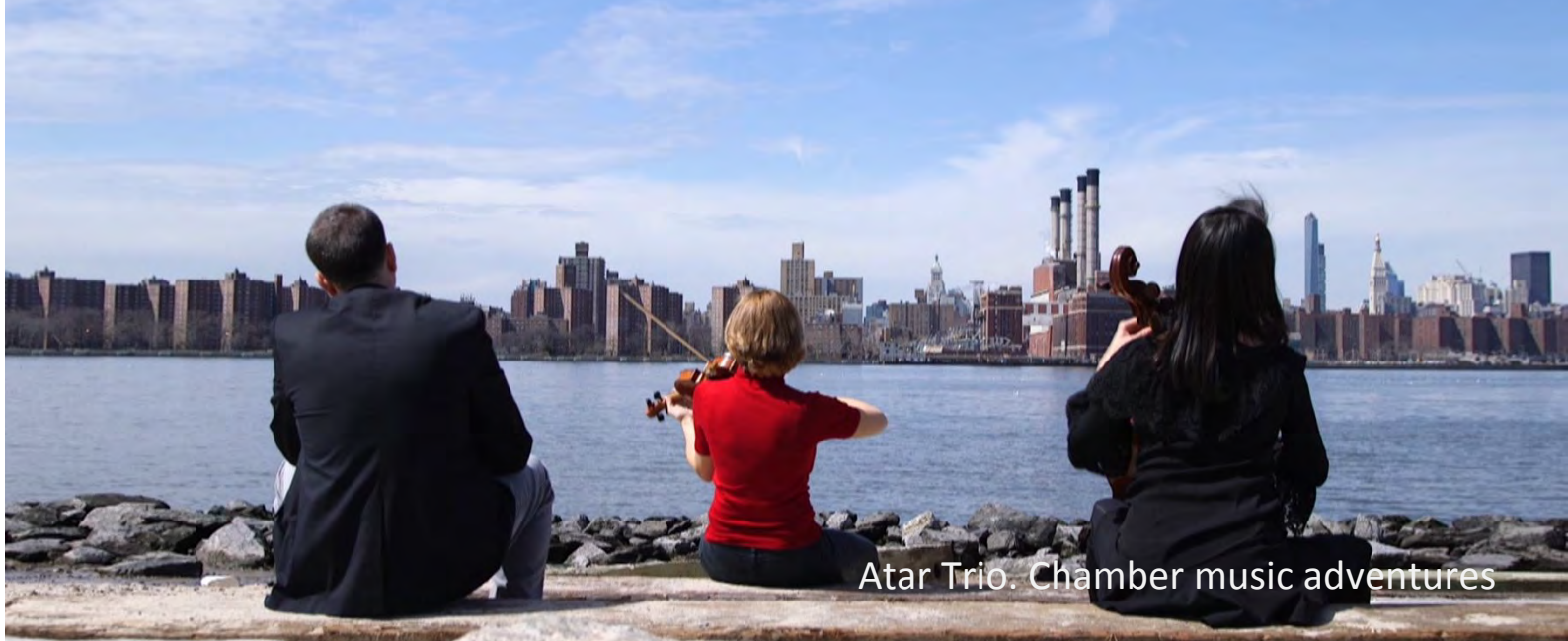
Atar Trio. Chamber music adventures